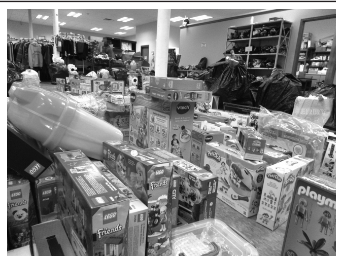
Christmas gifts are organized at Human Concerns for distribution to children of clients.

This program is also in need of gift cards in any amount. Popular gift cards are from Amazon, iTunes, Kohl's, Target, Walmart, and Marcus Theaters. Bring your gift cards to SMHC during open hours.